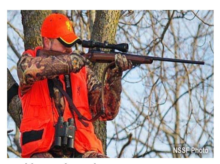
Double Word Puzzle #11 Answers on page 8 Find the word that satisfies both definitions.

Hunters should be aware of the increased number of people sharing the outdoors this fall. It is more important than ever to be absolutely sure of your target and what lies beyond it. Pre-season scouting should be maximized, and hunters should be prepared with back-up locations if their chosen spot is busy with other outdoor enthusiasts during this deer season. All outdoor enthusiasts must focus on safety and wear blaze/hunter orange when heading into the woods, onto the trail, or into the field.