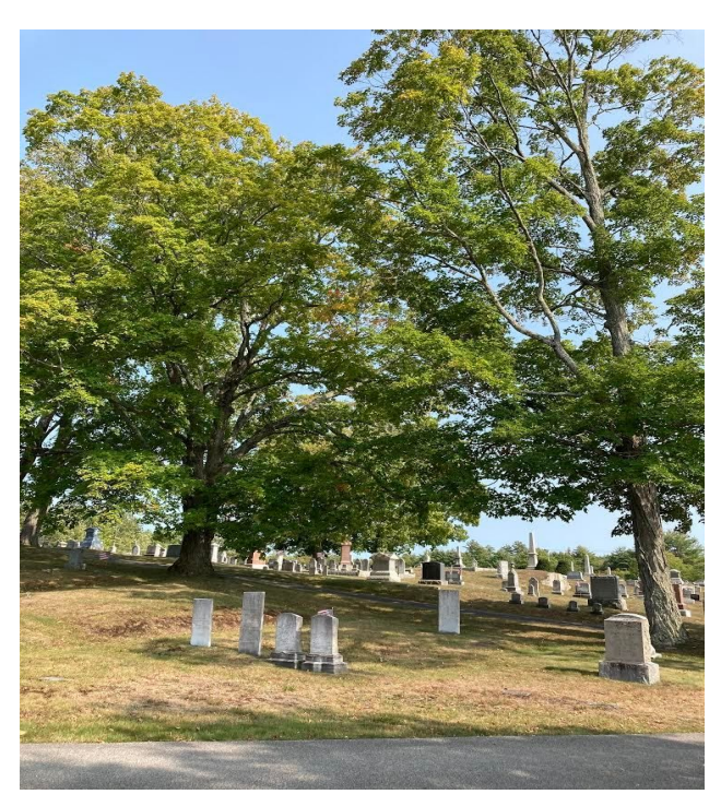
Floral Park Cemetery

Transitioning from paper maps and burial records to a secured electronic format was a multi-year project, and the Cemetery Trustees are thankful for the budgetary support of the Selectmen, Budget Committee, and taxpayers that allowed the records to be preserved.