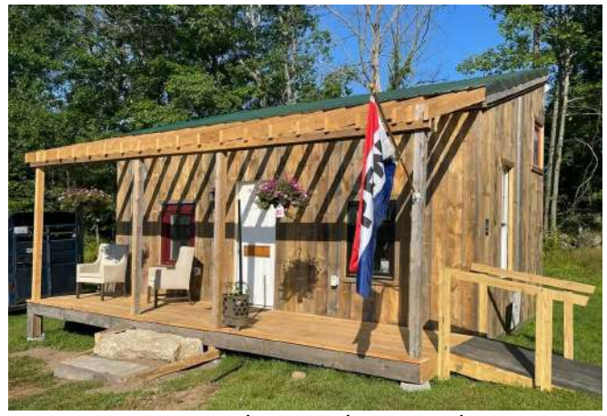
4-H Farmstand on Dowboro Road