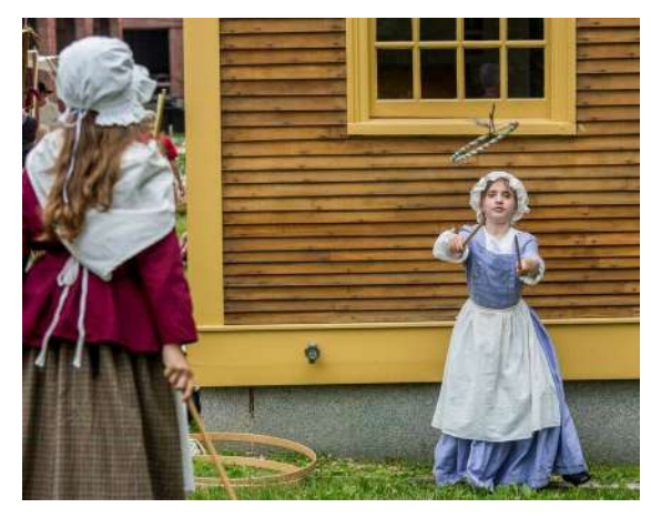
American Independence Museum, Exeter, NH

Would you like to expand your knowledge of NH, and go on some fun day trips at the same time?