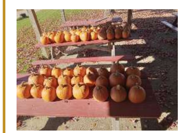
For Donating the Pumpkins to Harvest Fest

NH Senator Howard Pearl and Howard Pearl and Sons Farm