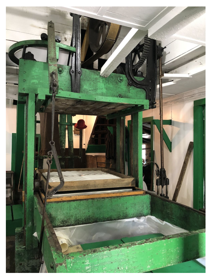
The one and only, original cider press, built in Gilmanton circa 1890