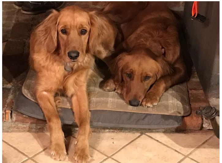
Rose & Finley, Golden Retrievers