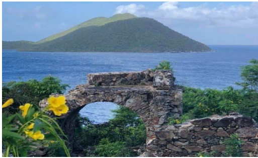
Photo of St. John USVI