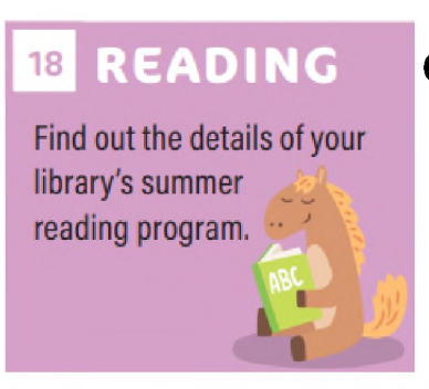
Grow, Learn, Read Daily Activity Josiah Carpenter Library