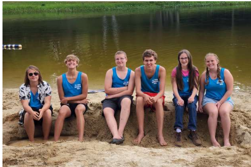
Thank you for a great season at the FB Argue Recreation Area.