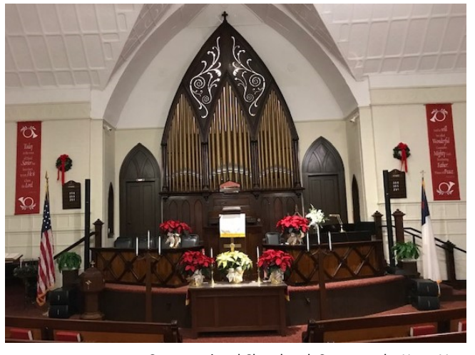
Congregational Churchurch Sanctuary by Harry Vogt

Parking and wheelchair accessible entry are located at the rear of the church at Chestnut Street. For more information, call the church office at 435-7471.