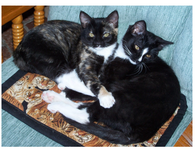
Snuggle Buddies Noelle and Tucker Allard