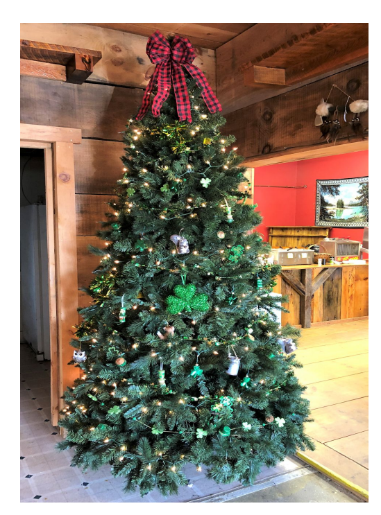
Shamrock Tree at Mike's Meats