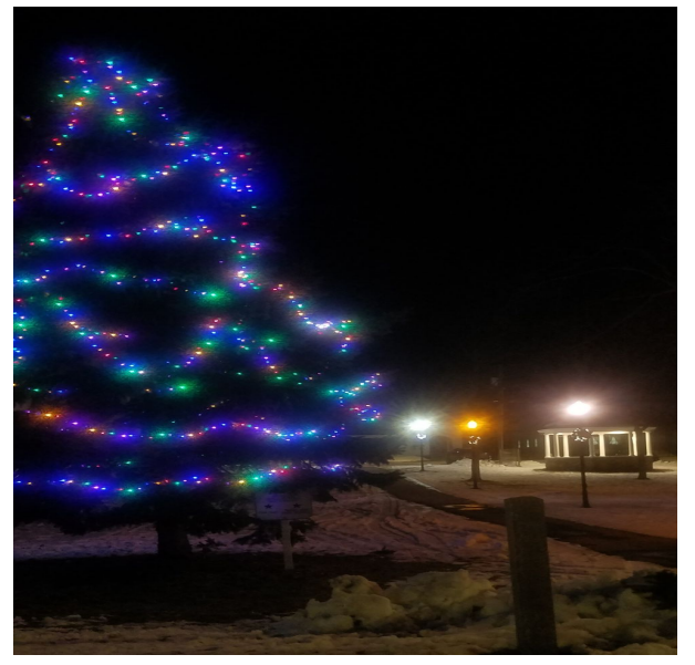
2018 Christmas Tree by Louie Houle

Please Note: The Children's Store is still accepting new or gently used gift items for caregivers, parents, family, friends and teachers. The store could also use men's items. If you're out and about shopping, please keep this in mind; small tools, flashlights, work gloves, hats, mugs, no clothing please. Donation boxes are located at the Pittsfield Post Office, Epping Well, Northway Bank, Main Street Variety, Town Hall and Jitters Café.