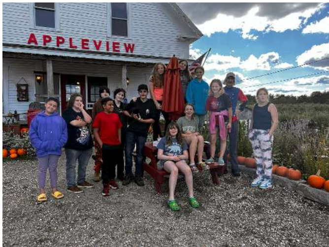
Youth at Pittsfield Youth Workshop on an apple picking event at Appleview in Pittsfield.

More information is available, including the recommendations from the Planning Board and Conservation Commission, at the Town Office (85 Main Street, Pittsfield, NH) and on the town website (www.pittsfieldnh.gov).