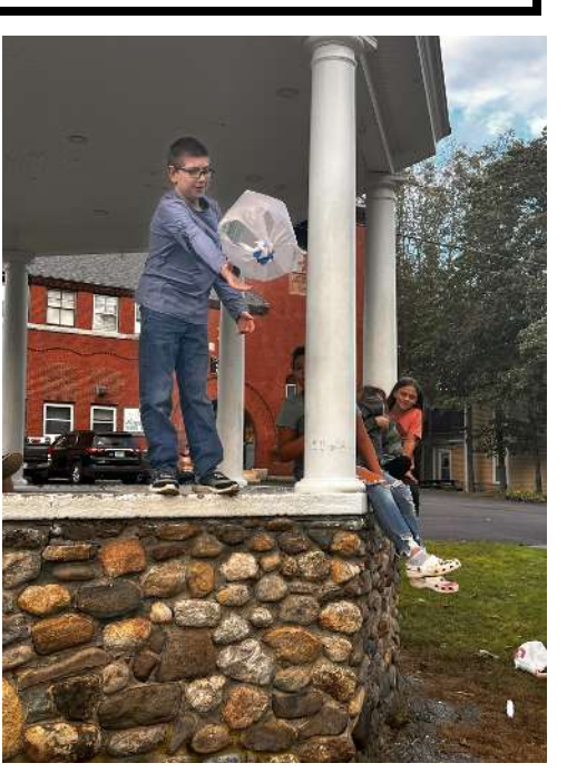
Youth at Pittsfield Youth Workshop enjoying the egg drop activity.

Monday, Tuesday, Thursday, and Friday from 3-6PM and Wednesdays from 1-6PM for early release days.