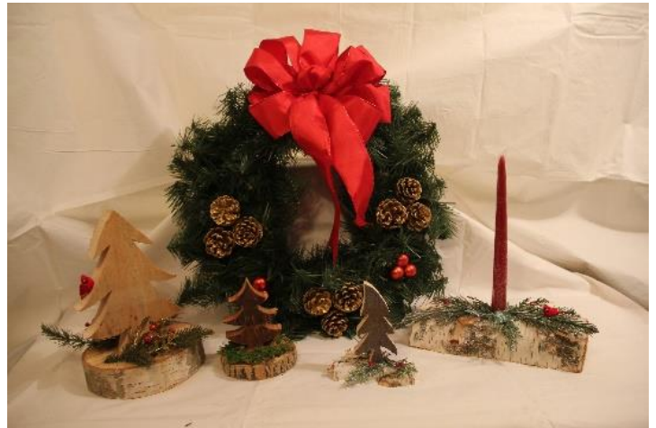
A Sample of Items for Sale at the Holly Fair

Come downtown for shopping and fellowship with your neighbors!