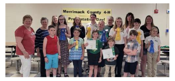
Presentation Day 2022

Since its humble beginnings, the club has served over 1,000 area youth not only in Pittsfield but also from the surrounding towns of, but not limited to, Gilmanton, Loudon, Barnstead, Chichester and Epsom. Members are taught life skills, such as building relationships, communication, decision making, time and money management, problem solving, goal setting, record keeping, writing resumes and teamwork. They also "Learn By Doing".SEE 4-H page 3