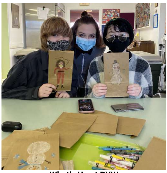
What's Up at PYW

Every year the youth at the Pittsfield Youth Workshop decorate bags for the local Meals on Wheels program, and we're currently looking for donations to put a smile on each of the recipients of these bags. We are looking for practical and fun items to stuff these bags. This year we will be needing enough items to fill 30 bags. Items like crossword puzzles, travel toiletries, chocolates, and small candies are some examples that would help us out. If you have any questions, please reach out to us via Facebook. We will be collecting donations until Friday, December 9. Thank you! Laurie Sweeney